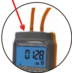
PC connection port